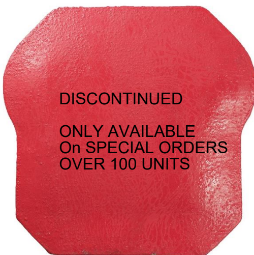
FEMALE PLATE FRONT