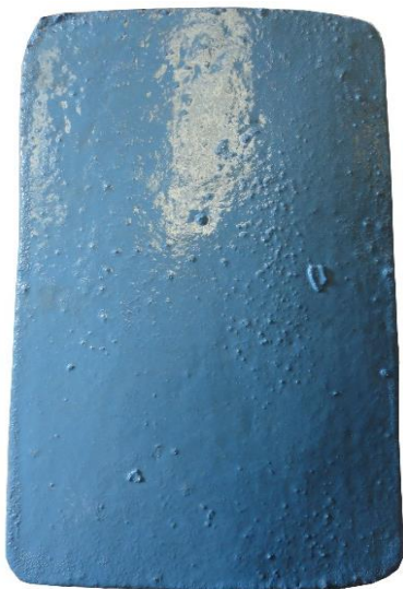
SIDE PLATE FRONT